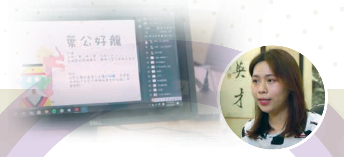
黃曉羚 / 2016年入學 文學士(中國語文研究)及教育學士(中國語文教育) 同期結業雙學位課程

CU in the CLOUD has undoubtedly been a valuable experience for me as a teacher-to-be. Participating in the CU in the CLOUD initiative has made me realize that teaching and learning should not be limited to the classroom. Online lessons can be a good alternative to usual classroom lecture, providing more flexibility with where, when, and most importantly how we teach and how students learn. The videos that I and my fellow classmates created for the CU in the CLOUD YouTube channel not only serve as supplementary materials for normal lessons, but also provides mathematical content which students do not usually learn during classes. The audience generally provided positive feedback and affirmation for my effort and contribution.