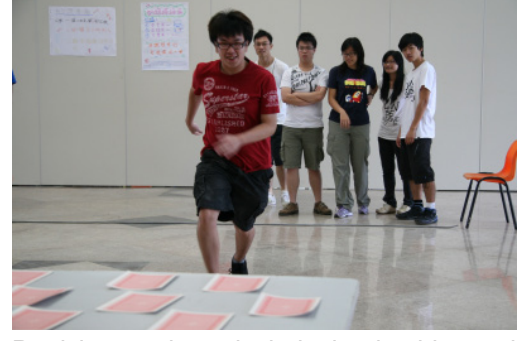
Participants honed their leadership and teamwork skills during a training Day Camp.

sessions including the Teaching and Learning course by Centre for Learning Enhancement and Research (CLEAR) and a Training Day Camp in Sai Kung by Wong Siu Sang Leadership Training Institute in June and July 2012. In the Teaching and Learning courses, participants were