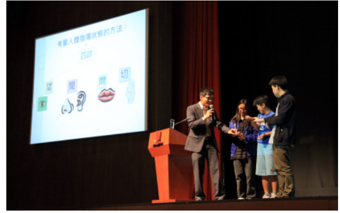
Many members of the audience found the lectures informative and interactive, heightening their interest in science.

For photo highlights of the event, please click here.