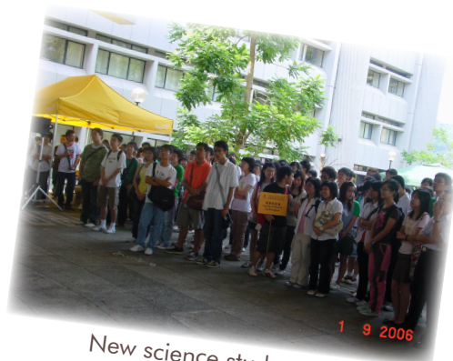
New science students