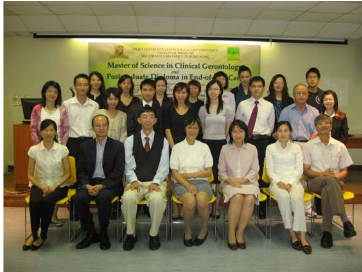
Group photo of the Best Projects Presentation Ceremony held on 5 November 2008