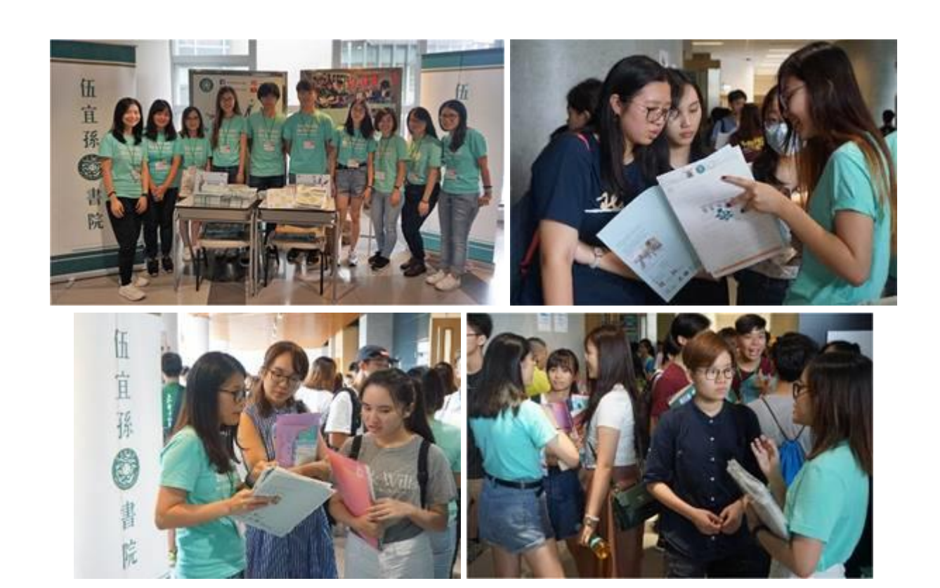
The New Student Orientation Day was held on Tuesday, 6th Aug to greet and welcome our freshmen, and to help them gain a better understanding on the College system and the campus environment.