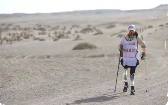
After rehabilitation, patients successfully finished the trip to Gobi Desert. 傷者復康後成功完成戈壁沙漠之旅。