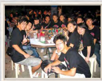
#Medicine #Study Lives