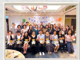
#Nursing #First-cohort BNurs Graduates Reunion