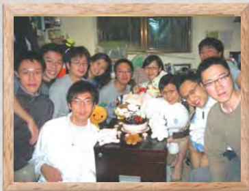
#Medicine #Study Lives #Hall Life

Do you have photos of your cherished moments at the Faculty? Share them with us and reminisce about those glorious times together with your friends, family and fellow alumni.