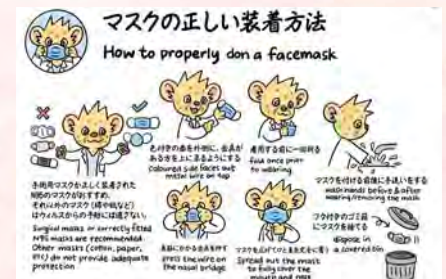
Dr. Dumo et al had been translated into over ten languages.

The book became an instant hit after being widely distributed for free, and has since been translated to more than ten languages, introducing the cartoon crew to children in other parts of Asia as well. Many organisations including some district councils, homeware stores, and child protection institutions have also shown interest in working with Dumo and his friends.