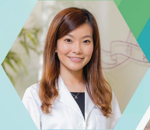
Dr. Anson CHAN