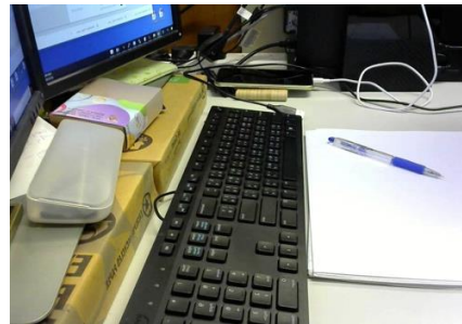
Figure 2 'Workspace' Meeting