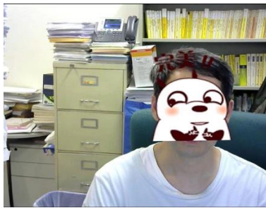
Figure 1 'Face' Meeting