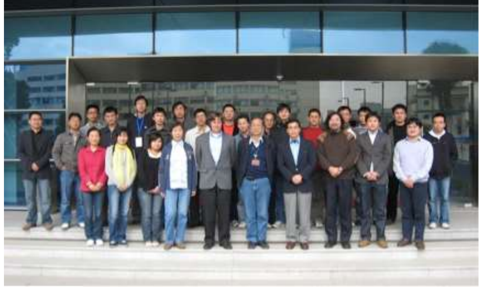
With researchers at Shanghai Synchrotron Light Source

Material Research Laboratory, Chinese Academy of Science