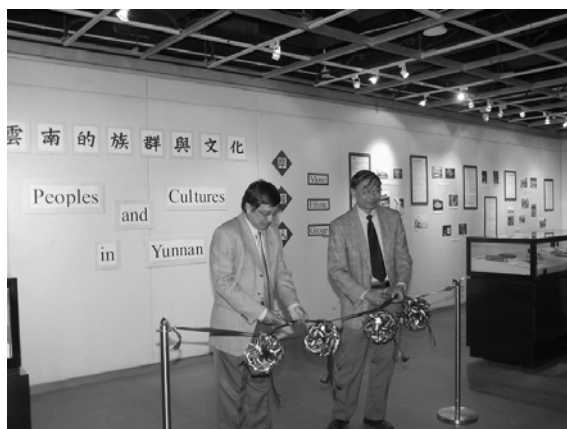
雲南的族群與文化展覽開幕儀式，新亞書院許氏文化館，二零零四年十月四日 The opening ceremony of the exhibition “Peoples and Cultures in Yunnan,” at the Hui Gallery, New Asia College, CUHK, Oct. 4, 2004.

二零零四年度人類學系暑期考察展覽——“雲南的族群與文化”，已在十月四日至十月二十一日期間，於香港中文大學新亞書院許氏文化館展出。展覽分為四個專題，就同學的考察內容，提供有彝族、白族、納西族和摩梭人之圖片、器物及文字介紹，充分展示了雲南石林、大理、麗江各地族群的文化生活面貌。