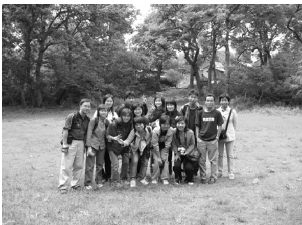
Visiting Yuehu village, Shilin (Stone Forest) County, Yunnan Province, May 25, 2004. 在雲南省石林縣月湖村考察彝族宗教祭祀活動，該地為彝族密枝節祭祀場所 2004-5-25