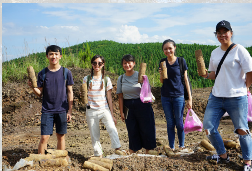
2019 Archaeological Fieldwork Internship in Hunan, China

考古學是對過去人類社會的人類學洞察。傳統的考古學是以調查和發掘為「觀察」過去的主要方法，但在獲取資料以後，考古學家有責任向大眾闡釋工作的意義。如何用文物把過去有意思的故事「講清楚」，也是考古學界近年來關心的前沿問題。2019年的考古田野考察，我們嘗試用不同於傳統的方式讓學生體驗田野。人類學系與湖南郴州市博物館簽訂合作協議，在6月份暑期課程期間，帶領學生參與漢代墓葬文物的資料整理，同時訓練學生利用三維建模方法，為以後博物館觀眾提供互動、「親身」了解文物的三維模型。我們也配合研究項目，介紹並訓練利用手持x螢光譜，對文物進行無損分析，探討古代文物的成份和制作工藝等以往多被忽略的資料。