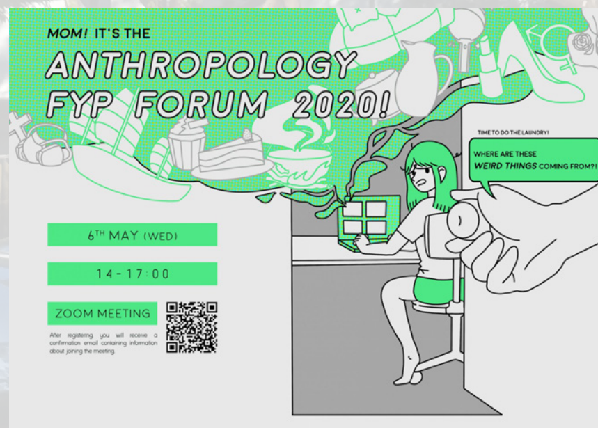
2020 Final Year Project Forum