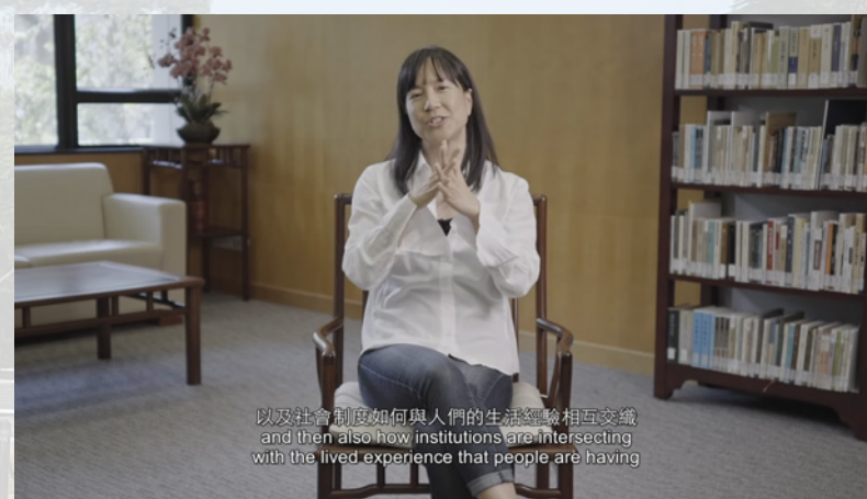
Anthropology: What and Why?