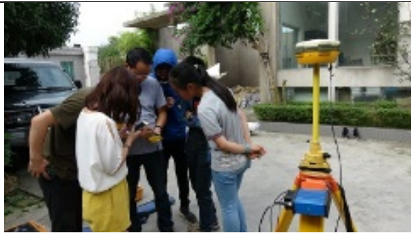
嘗試使用 rtk 儀器