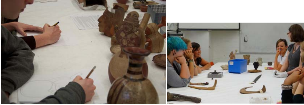
Students having material handling class

Thanks to my wonderful colleagues who were both passionate and eager to share their knowledge in promoting museum collections, this summer internship experience has made my past summer the most meaningful one in life. What the internship benefits me the most was the inspiration on how I can apply my theoretical understanding about anthropology and archaeology into the work of collections preservation, research, education and public outreach, bringing social impact to the public. From the public outreach activities, I have come to discover that every single individual is born to absorb, reinvent and sustain cultures. Beyond this, I have come to realize the cultural uniqueness of Hong Kong, and was aspired to become a cultural ambassador in Hong Kong promoting the significance of our cultural roots with a global vision through working in a local museum after graduation.