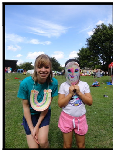
Participant proudly presenting her mask