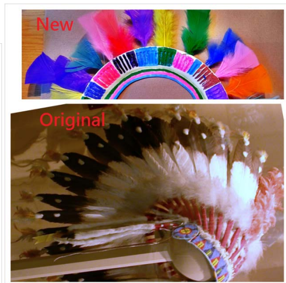
CHYPPS participants expressed their creativity through the handicrafts making workshops