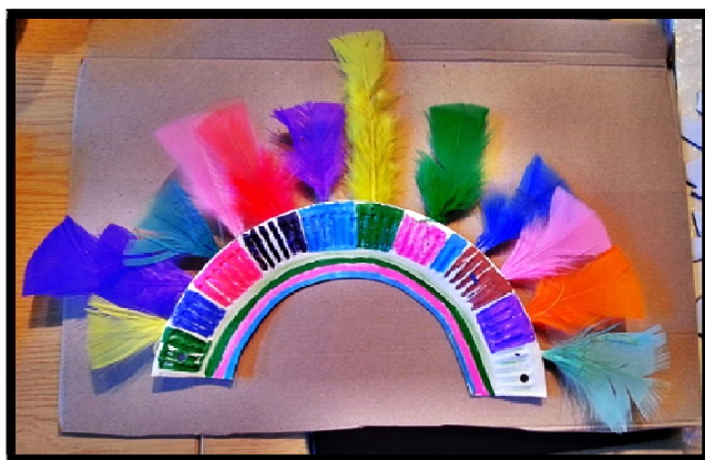
The young children's product adapted from Dari headdress

encouraging the appreciation of arts and the expression of creativity. The handicrafts had brought the history and culture behind the collections into the participants' lives. This also empowered them as the agents to create and enrich culture, to pass on the inspiration to the wider public when proudly sharing their products with their peers and families.