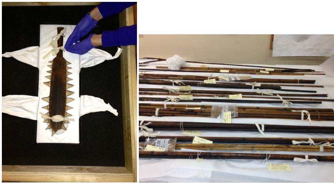
Handling collections with gloves

Collections management is not about handling dusty and boring 'dead objects', but instead it sustains the life and mission of each unique artifact. While human beings have limited lifespan, the artifacts can live forever as the proof of the extraordinary stories from our ancestors.