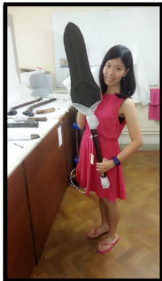
Handling Fiji Clubs

starting from packing, storing to pest control. I had to wear a pair of specially designed protective gloves in order to avoid contaminating them with the bacteria on my hand. It was also very important to identify the most fragile parts of objects, which needed extra protection from pressure. Then, the collections were packed into different boxes according to their sizes and categories. Finally in the final phase of storage, storage area had to be maximized for as many as collections as possible. I also had to keep all the collections from pest damage by putting pest traps all over the storerooms and exhibition areas. And regular checks had to be conducted to exterminate the reproduction of harmful pests.