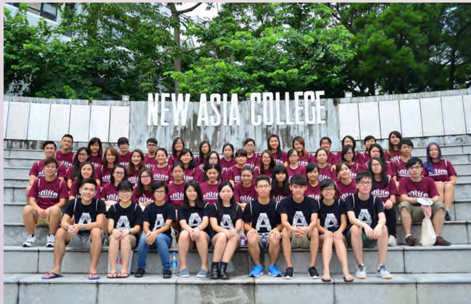
Group photo taken at the orientation camp