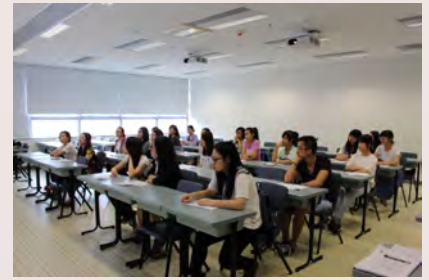
New Anthropology students attending the academic counseling session

This year, we have 28 students joining the department. A big welcome to all of them! We wish them a fruitful university life and an inspiring intellectual journey at the department!