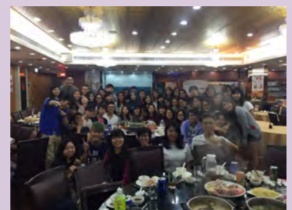
Group photo taken at the dinner

The student society had organized a dinner in Tai Wai to celebrate the start of a new academic year. Alumni and students of different years joined the dinner and enjoyed the hot pot meal together. The student society also prepared a red packet with coins inside for each student, wishing them a good GPA in the coming semester. The dinner was full of laughter and happiness.