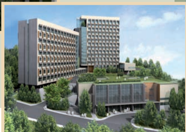
善衡書院透視圖 Perspective of S.H. Ho College