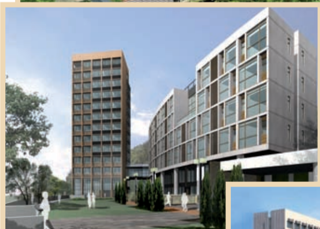
晨興書院透視圖 Perspective of Morningside College