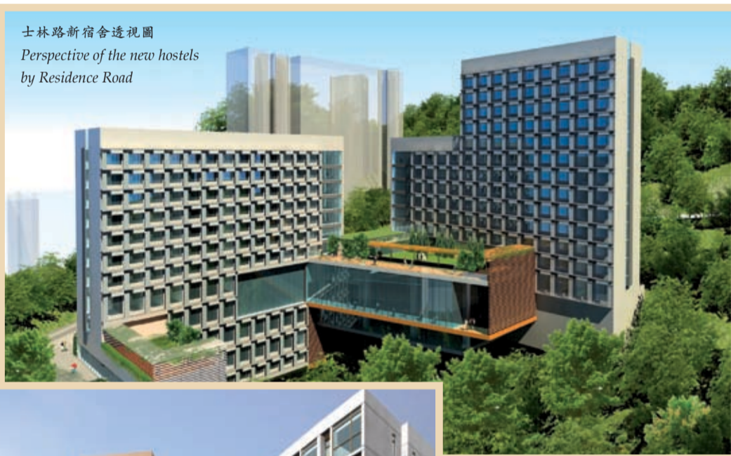
士林路新宿舍透視圖 Perspective of the new hostels by Residence Road