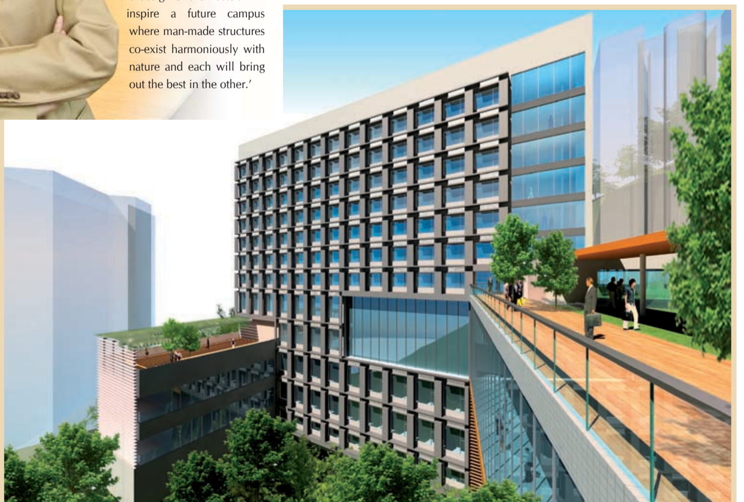
士林路宿舍透視圖 Perspective of the new hostel by Residence Road

The German philosopher Friedrich von Schelling once said, 'Architecture in general is frozen music.' Will the two new hostels by Residence Road, upon completion, impress upon the viewers as musical notes with their undulating profile and rhythmic pattern? If all the buildings on campus are a symphony, we can expect them to herald a charming new movement. *