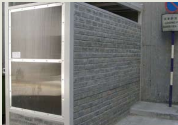
垃圾站外牆採用環保再造磚興建 The RCP's main wall is made of Eco-Glass Blocks

物料回收承辦商每天兩次往垃圾站收集廢物，該垃圾站由物業管理處的庶務及樓宇管理組管理。