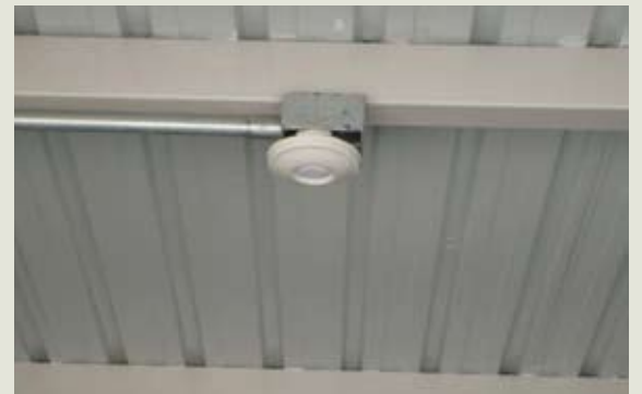
垃圾站安裝的太陽能照明感應器 Solar lighting occupancy sensor installed in RCP

The new RCP was built partially with environmentally friendly ECO-Glass Blocks into which an air cleaning