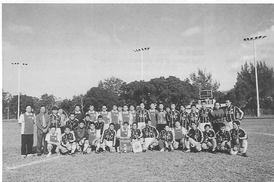
一月十日，書院在大學運動場舉辦遊藝會暨足球賽，由書院師生組成的足球隊與明星足球隊作友誼賽。明星隊以二比零獲勝。賽後兩隊合照。 The Movie Stars Football Team and the Shaw College Teacher/Student Team after a football match on 10th January at the University Stadium

Congratulatory message from head of New Asia College