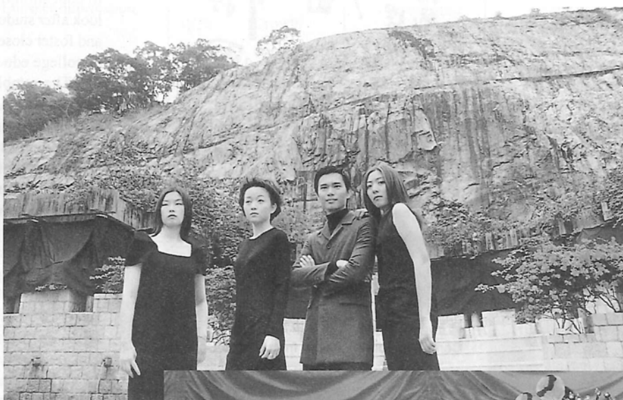
學生在惠園舉辦時裝表演 A fashion show organized by students at the Forum near the University Library