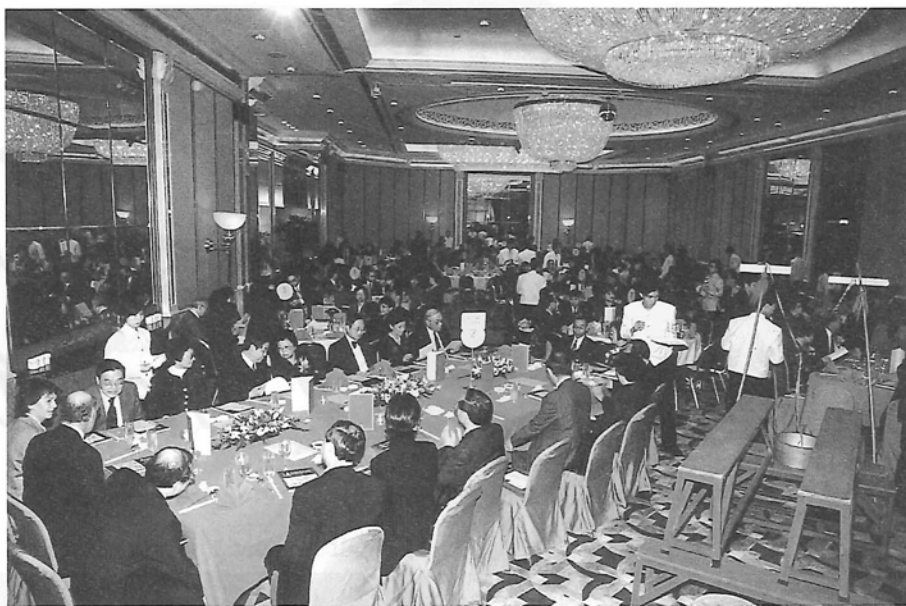
一月九日在紅磡海逸酒店舉行的十周年晚宴 The anniversary banquet held at the Harbour Plaza Hotel in Hung Hom on 9th January

Congratulatory message from head of Chung Chi College