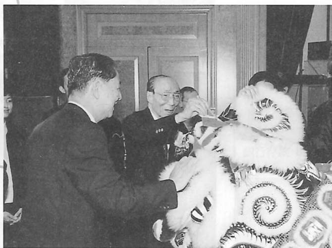
書院創辦人邵逸夫爵士在十周年院慶晚宴上為醒獅點睛 Sir Run Run, the College Patron, dotting the eyes of the lion before the lion dance