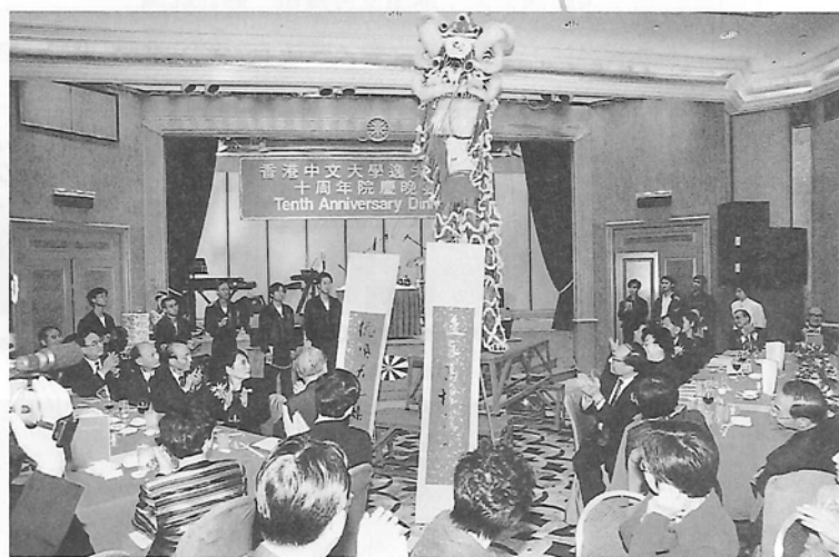
醒獅表演 Lion dance at the anniversary dinner