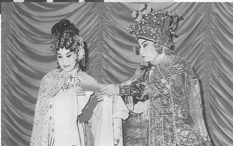
一月廿二日粵曲演唱晚會的折子戲表演 Cantonese opera performance at concert 'Tolo Lyrics' on 22nd January