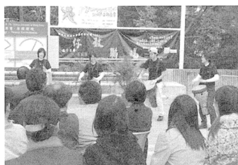
Students playing African drums at the opening ceremony