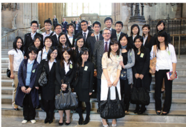
Visit to UK House of Parliament

Undergraduate students who are expected to graduate in May 2011 or thereafter are welcome to apply.