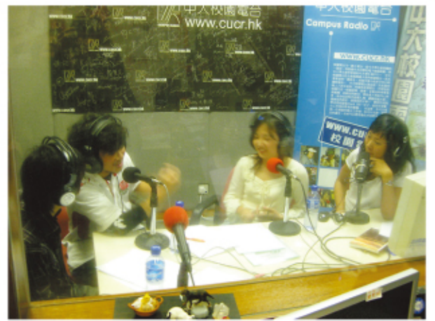
Production of Episode 2 in the CUCR Studio

Have you ever thought of being a DJ on campus? In "Culture Blog 文化博客", a new radio programme jointly produced by the Incoming Students Section, Office of Student Affairs, and the Chinese University Campus Radio (CUCR), student DJs who come from different parts of the world share their cultural interchange experiences through radio waves every month. The "On Air" signal light is now lit – let's hear the sharing of the three student DJs who joined the second episode – "Go Global!"