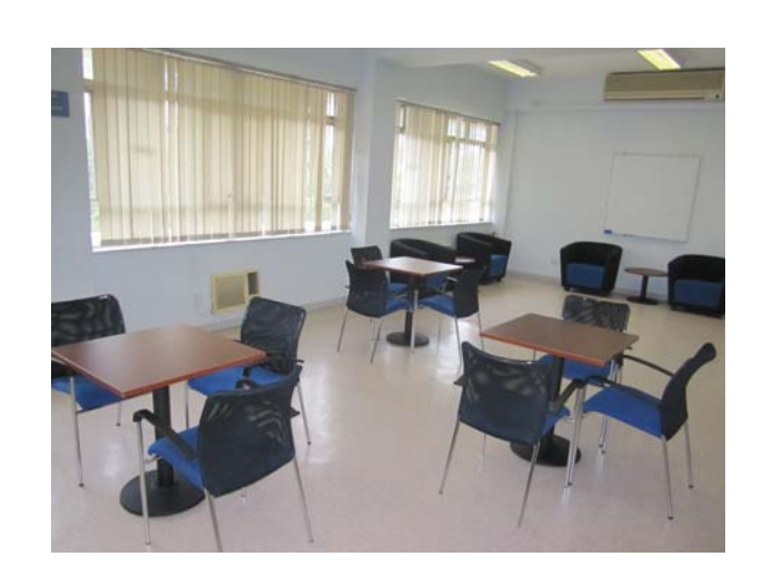
Student Activity Room at Room 306 Benjamin Franklin Centre

For the Student Activity Room at Benjamin Franklin Centre, all registered student bodies can also make reservation for student functions via the Online Booking System managed by the Office of Student Affairs at <a href="https://osanta.osa.cuhk.edu.hk/booksys/login.asp?which_page=6">https://osanta.osa.cuhk.edu.hk/booksys/login.asp?which_page=6</a>.