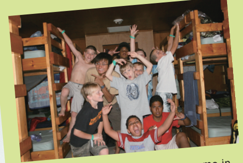
The Global Internship Programme in the US offered a taste of a different culture.