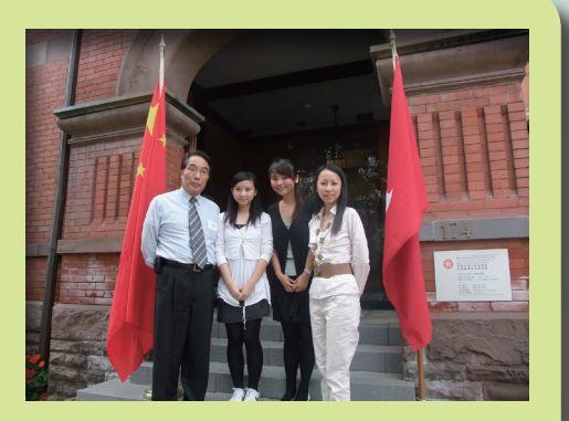
Students spent the summer in Hong Kong Economic and Trade Office of Toronto, taking part in various cultural and economic activities.

In the past summer, CUHK students spent a meaningful holiday in different parts of the world. They explored more about themselves, enhanced their self confidence, practiced knowledge and skills acquired from books and classes, learned to appreciate another culture, and above all, gained life-long friendship!