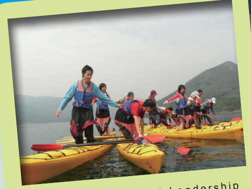
Through the Student Leadership Development Programme, students step out of their comfort zone to take up challenges like canoeing, staying overnight on an outlying island with limited resources.