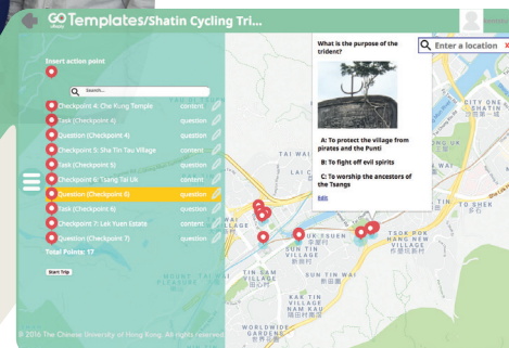
▲ 設定問題——其他隊伍的學生要在檢查點範圍內作答 Designing questions for other groups to answer within effective range of checkpoints