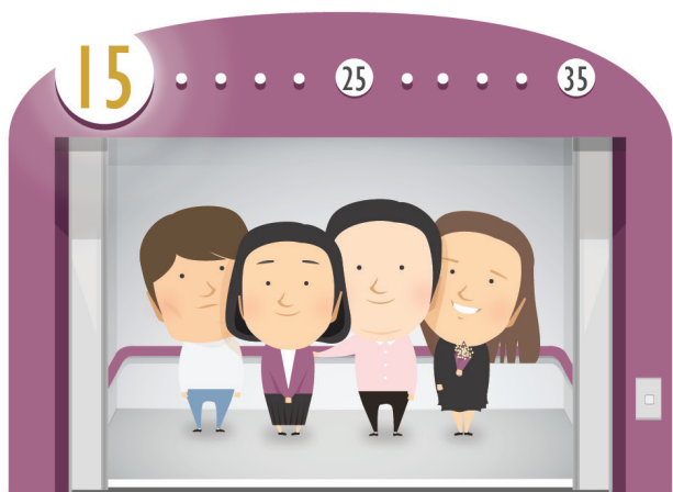
102 位獲「十五年長期服務獎」 15-year long service awardees