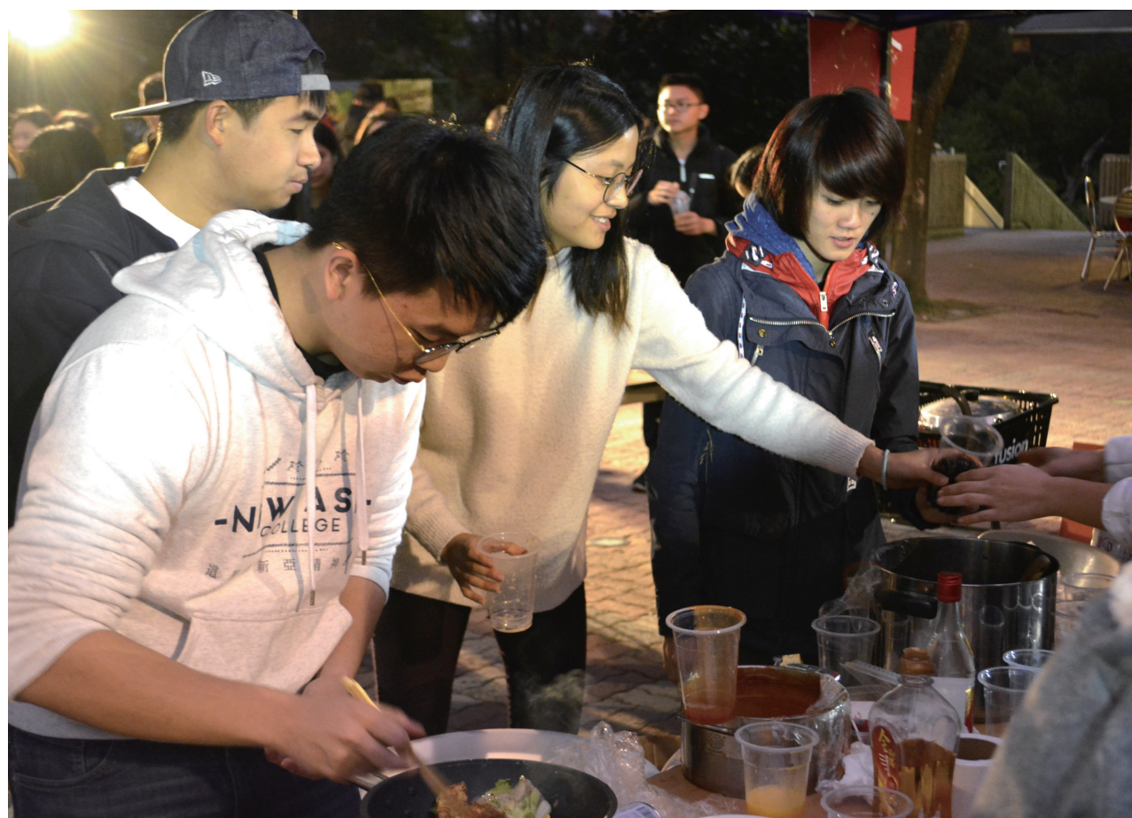
▲ 台灣生親自預備特色食物 Preparing Taiwanese traditional snacks