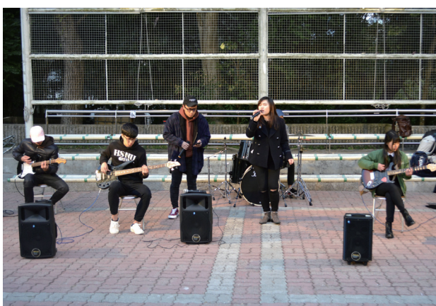
▲ 台灣生演唱地下音樂 Students are performing underground music

Although Taiwanese students and local students look alike, the former's culture is in fact very different from the latter's. Professor Wong believes that non-local students would make our campus a more multicultural community where mutual understanding can be more easily fostered. 'Enabling students to appreciate and respect other cultures not only brings positive influence on their character formation, but also improves their social skills and encourages all-round development.'