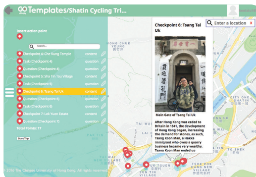
▲ 學生設立檢查點，描述該地的歷史背景 Setting up checkpoints to describe the history of the location