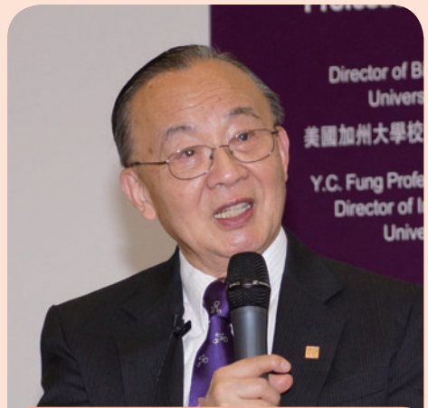
錢煦教授 Prof. Chien Shu