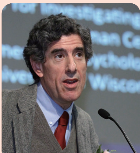
理察·大衛遜教授 Prof. Richard J. Davidson