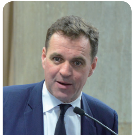
尼爾·弗格森教授 Prof. Niall Ferguson