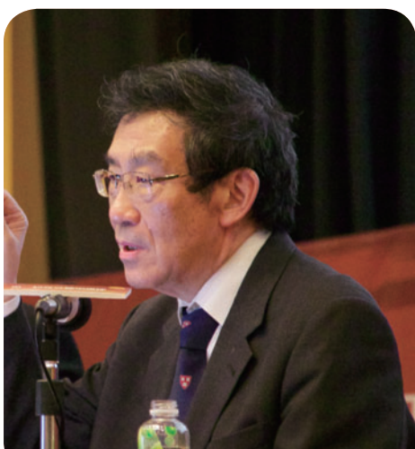
杜維明教授 Prof. Tu Weiming