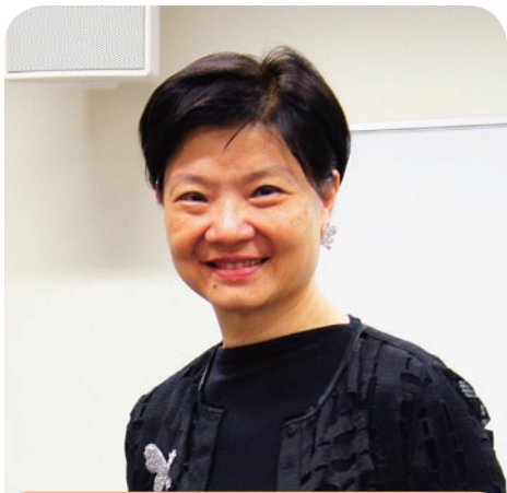
余若薇女士 Ms. Audrey Eu Yuet-mee