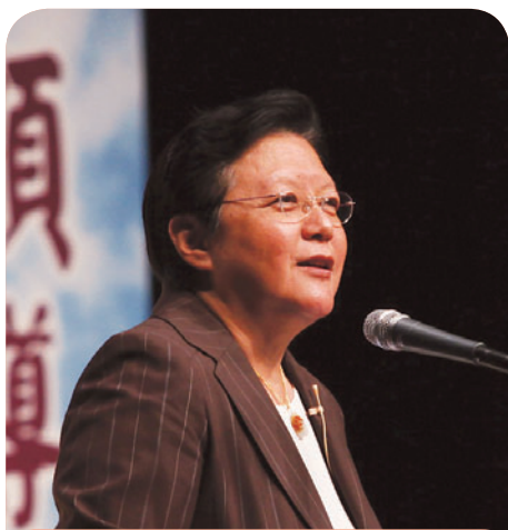
范徐麗泰博士 Dr. Rita Fan Hsu lai-tai

Famous scholars, artists, social leaders and other distinguished figures can often be seen at the symposia, assemblies, visiting scholars programmes, tea gatherings, high table dinners, and other events organized by the Colleges. They are invited to share their experiences and knowledge with students with the aim of broadening the horizons of the latter.