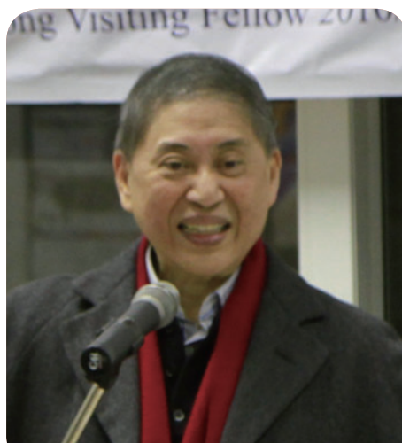
白先勇教授 Prof. Pai Hsien-yung Kenneth