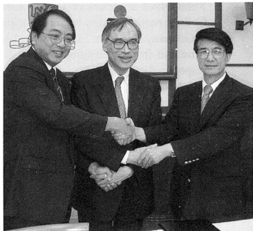
(From left) Prof. Tsui Lap-chee, Prof. Lawrence J. Lau, and Prof. Paul Chu

The Chinese University signed a Memorandum of Understanding on the establishment of the Joint Centre for Advanced Study with the University of Hong Kong, and the Hong Kong University of Science and Technology on 10th September. The memorandum enables the three institutions to deepen their collaboration and, by pooling resources and capitalizing on their respective strengths in postgraduate studies, enhance Hong Kong's capacity to provide some of the finest educational opportunities in the world.