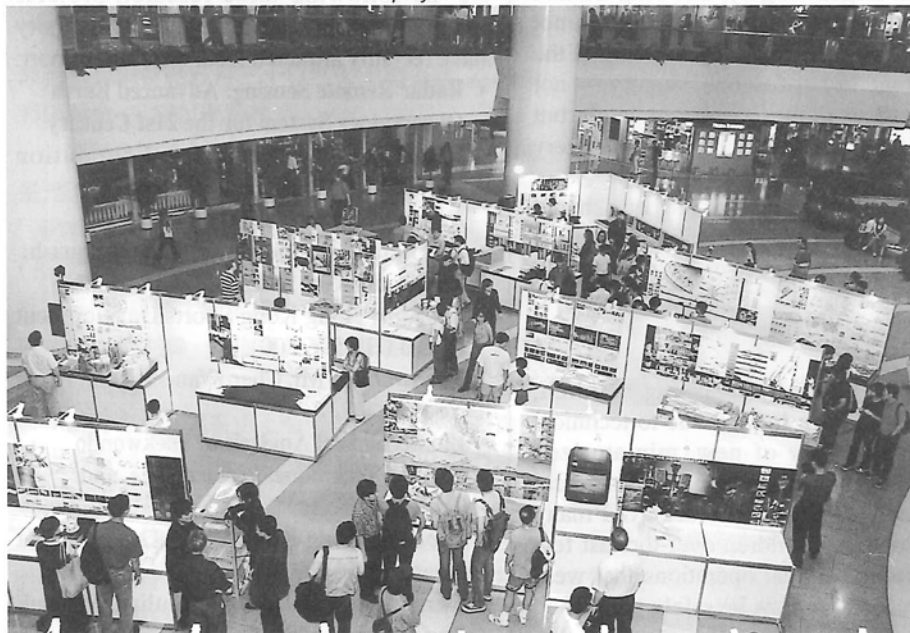
Pacific Place is another venue for the display of the models

The students presented their pieces and shared the views of the school students at the opening ceremony of the exhibition of the models on 29th May. The models were then displayed in Room B5 of Ho Tim Building for a week.