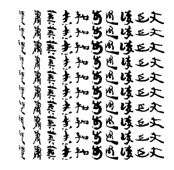
Fig. 3. 100 queries deformed from 10 character images for performance evaluation.

The 30-dimensional edge direction of histogram is not an efficient feature for Chinese cursive script character image retrieval as 21% of the targets are ranked behind the top 70 positions. As the histogram of an image is treated as a 1-D discrete signal, it can not have enough discriminative information for image retrieval on a large scale database.