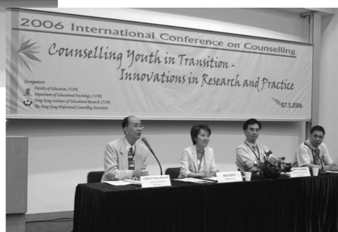
A paper session on "Career Interventions: Youth and school-to-work transition" during the Conference