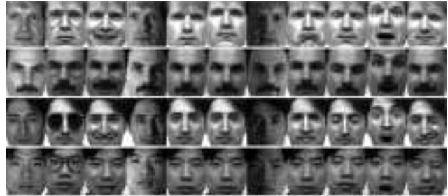
Figure 5. Snapshot of cropped Yale database