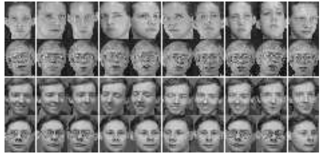
Figure 4. Snapshot of ORL database

The second experiment is evaluated on Yale face database from Yale University. The database contains 165 images, including 15 distinct people, each with 11 images that vary in both expression and lighting. Fig. 5 shows a snapshot of 4 individuals.