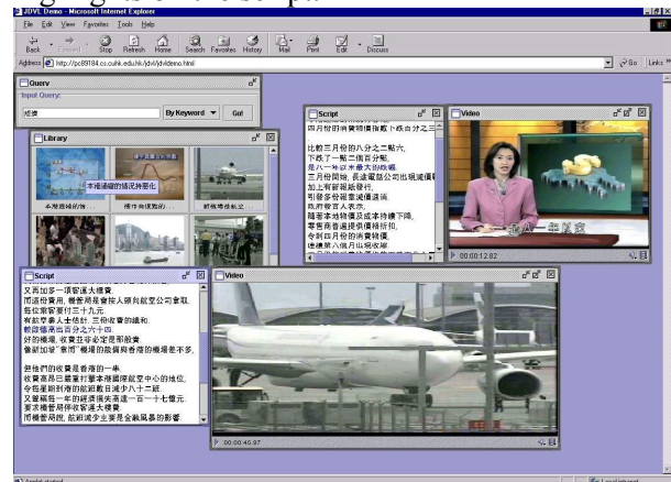
Figure 3. A Java Applet Client

Client Application is the presentation subsystem of XDVL. In essence, it only handles query submission, query result presentation and video playback. In our earlier client prototype (Figure 3), we adopt a Java Applet thin client that allows user to query by title, keyword or script. After submitting the query, the returned results are shown in thumbnails with their titles and short description for user to locate their interested video faster and easier. When the user clicks on a thumbnail, the selected video will start playing in stream with synchronous running highlights on the script.