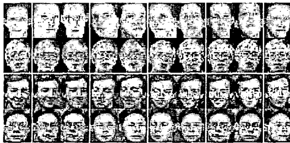
Fig. 2. Snapshot of ORL database

First experiment is performed on the ORL face database from AT&T Laboratories Cambridge. The images are gray-scale with a resolution of 92 \times 112 pixels. The database contains 400 images, including 40 distinct people, each with