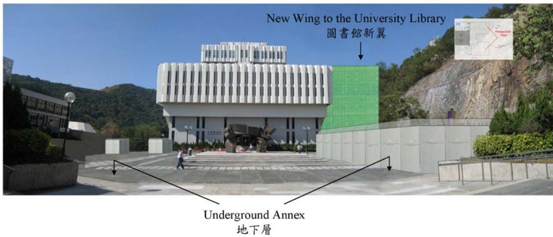
圖三： 施工後期大學廣場外觀 Attachment 3: View of University Square at Later Stages of Construction