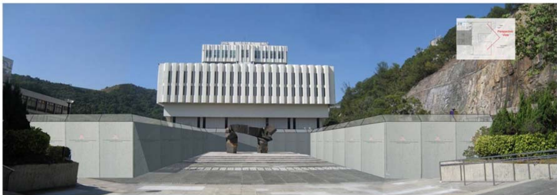
圖二： 施工前期大學廣場外觀 Attachment 2: View of University Square at Early Stages of Construction