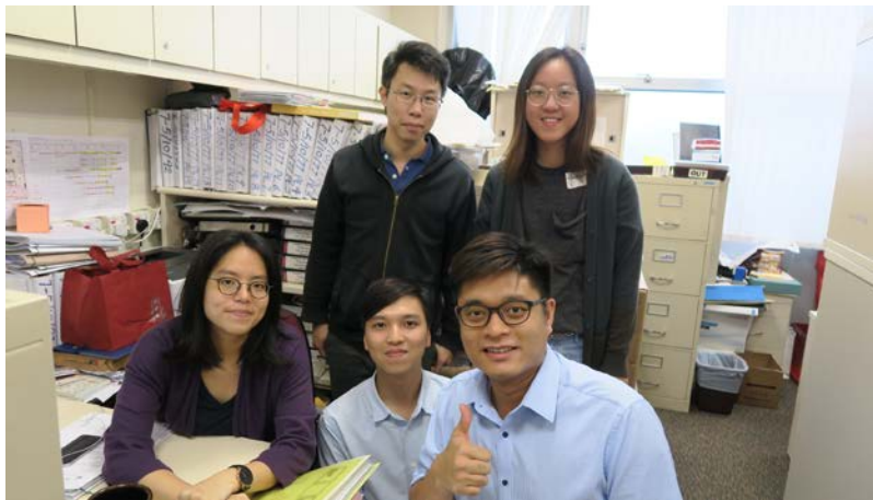
Fig 3: Photo with my colleagues! :)

I would like to express my gratitude to my supervisor and my colleagues for their devotion of time teaching me and allowing me to have hands-on experience in many aspects of their work. Also, the department provides us such precious learning opportunity. They gave many opportunities to me to participate and observe in different work. There are some reflections related to the roles and discourse of the museum in presenting the exhibitions and collection, also how to negotiate the roles of museum from the communication with the public, I hope I will have more chance to explore after this internship opportunity.