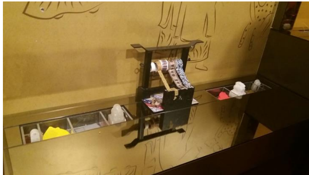
The materials used in the corner for the public