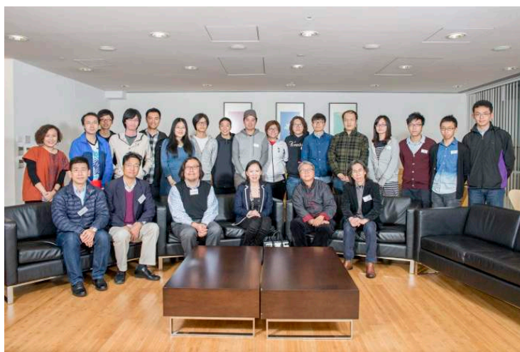
哲學學部研究生及老師。 Postgraduates and academic staff, Division of Philosophy.