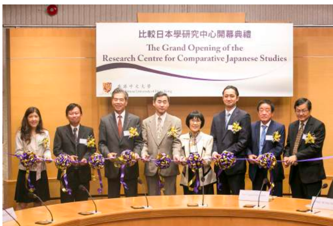
2014年比較日本學研究中心開幕典禮。 The Grand Opening of the Research Centre for Comparative Japanese Studies in 2014.

For detailed study schemes and admission requirements, visit our website: http://www.jas.cuhk.edu.hk/en-GB/