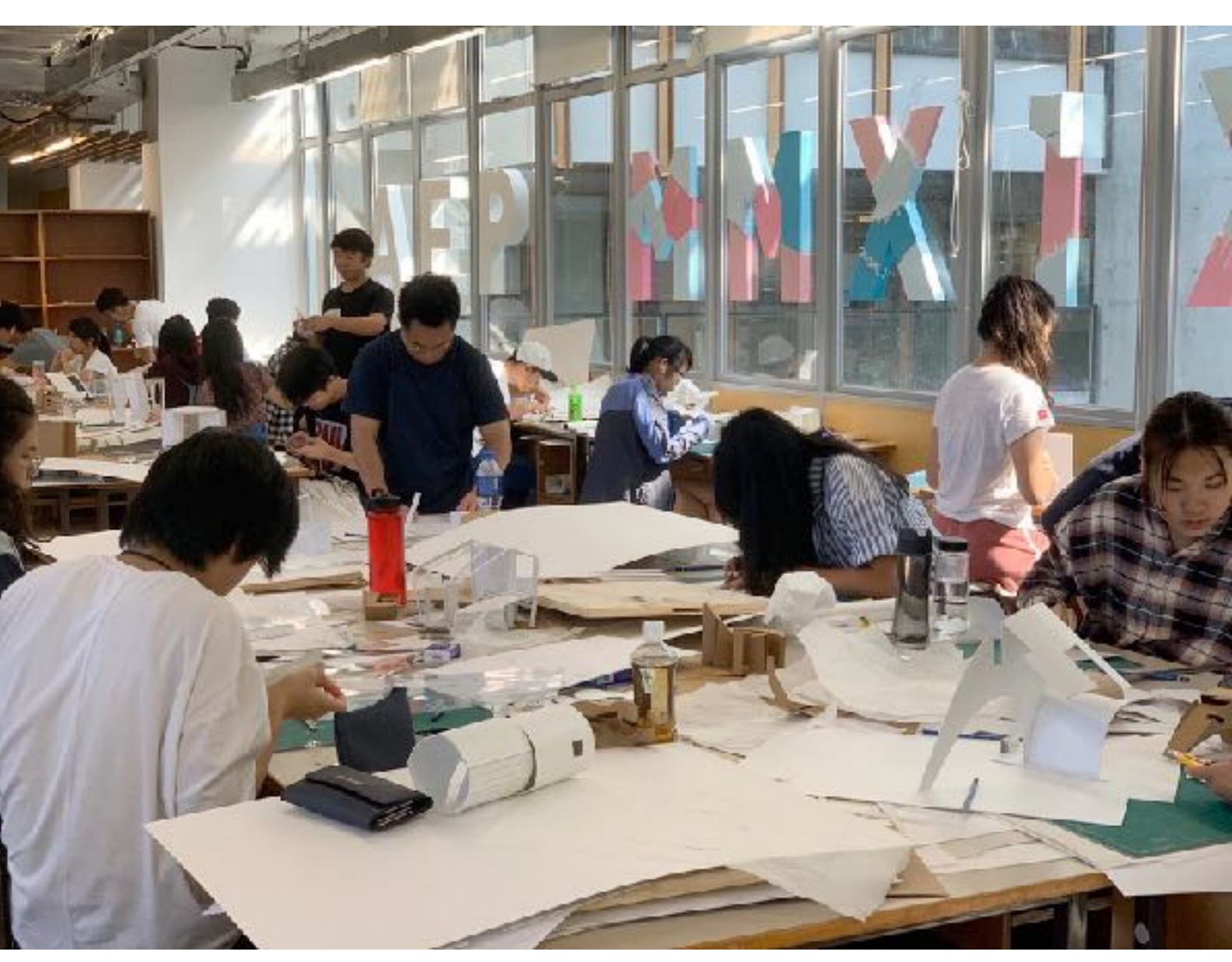
Students working with models and drawings in the design studio