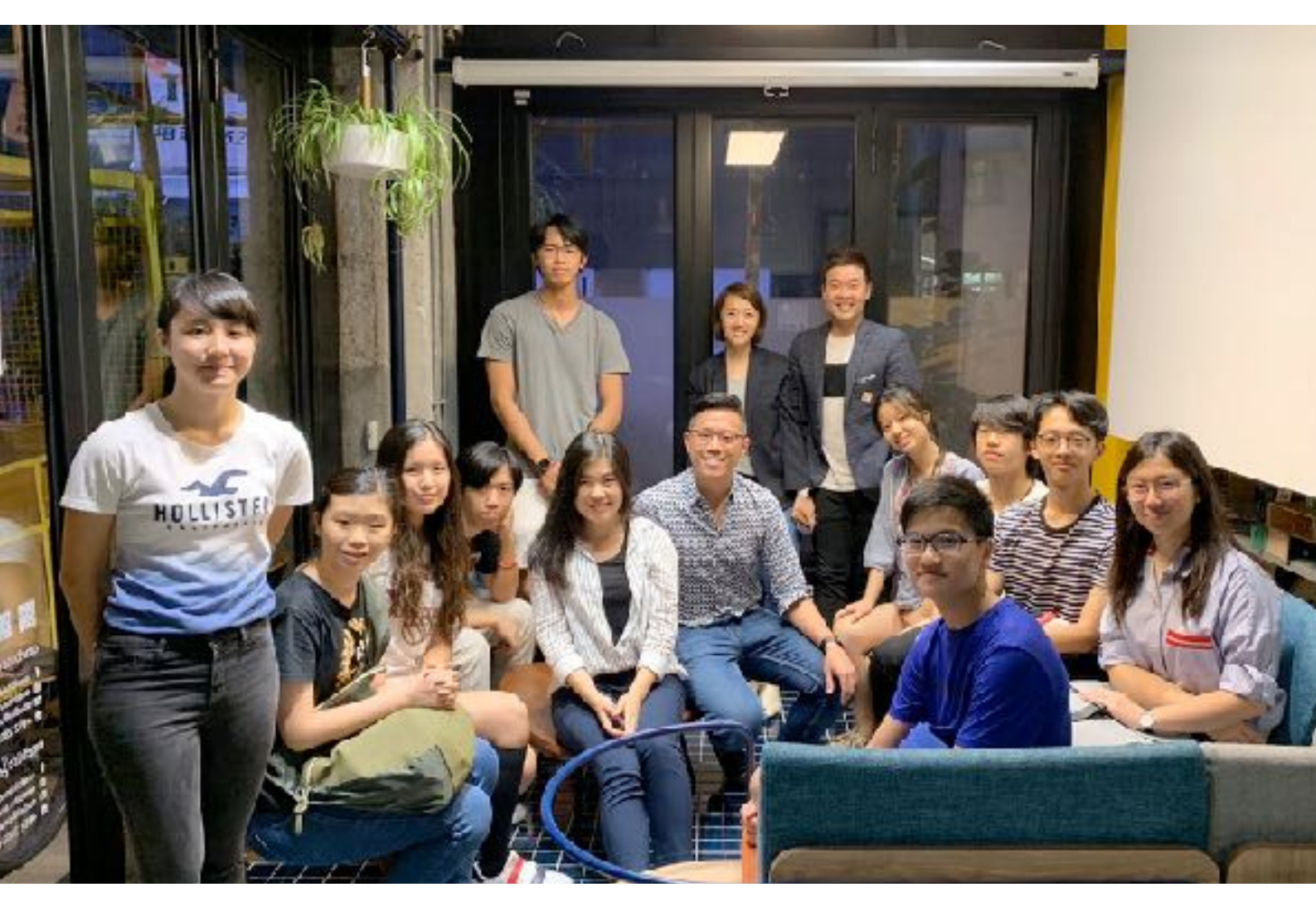
2019 AEP visits One-Bite Studio Hong Kong office