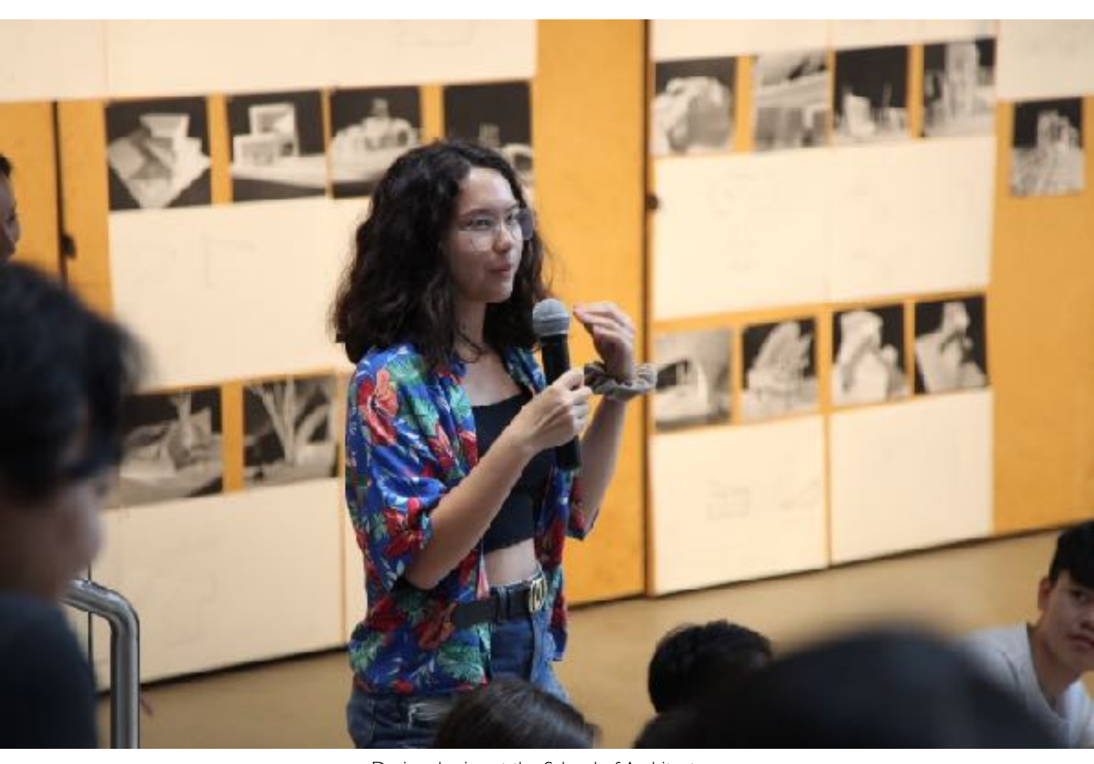
Design sharing at the School of Architecture