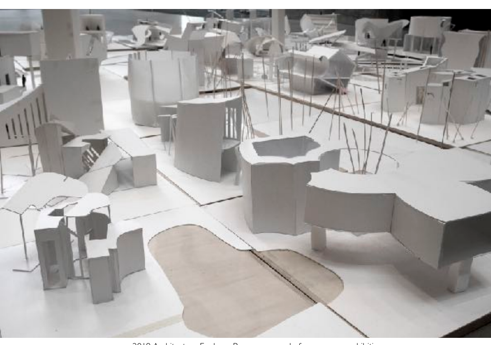
2019 Architecture Explorer Programme end of programme exhibition