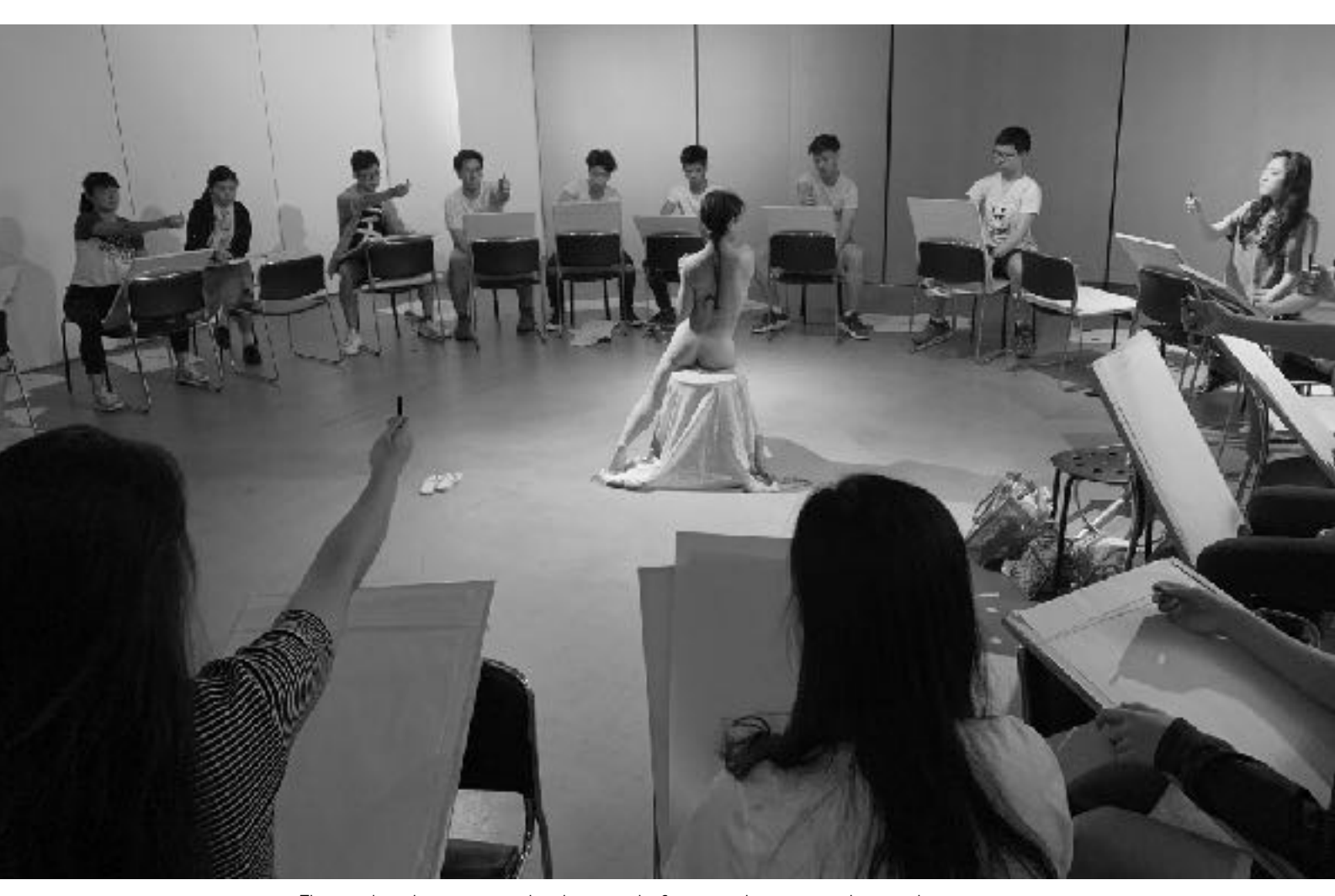
Figure drawing as a method to study form, scale, proportion and movement