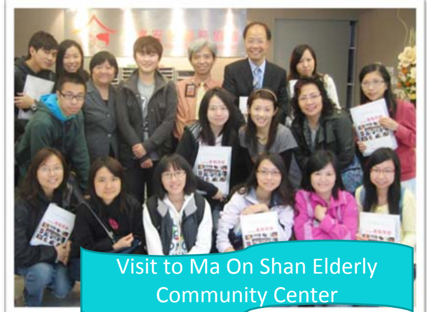
Visit to Ma On Shan Elderly Community Center