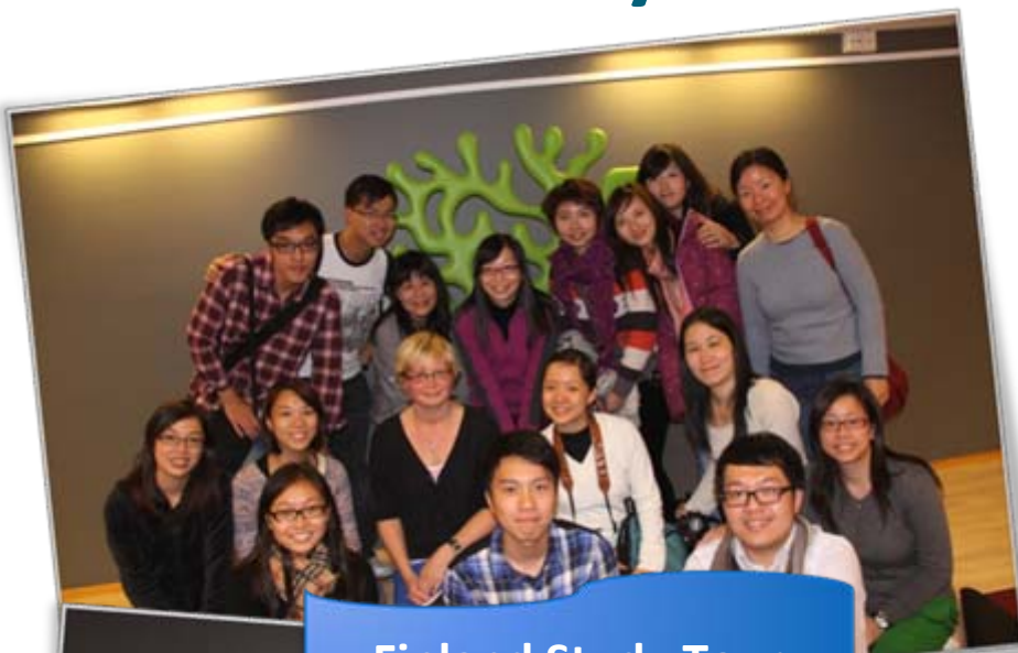
Finland Study Tour