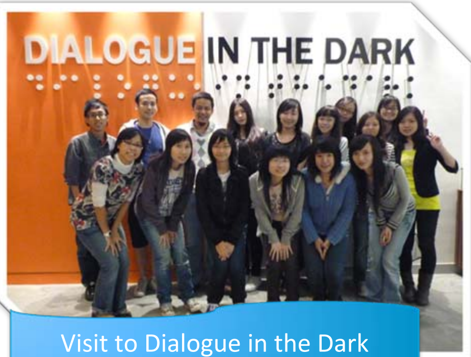
Visit to Dialogue in the Dark