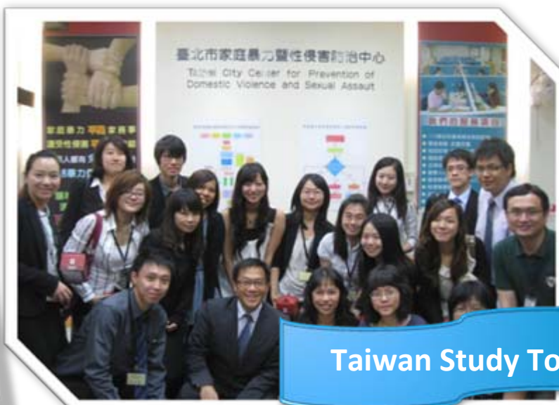
Taiwan Study Tour