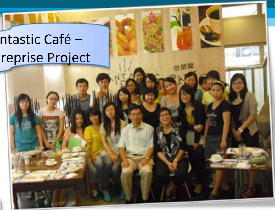
Visit to Fantastic Café – a Social Enterprise Project