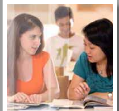
7:00 pm Casual dining with native speaking Communication Partner from CUHK