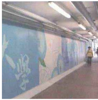
8:50 am Arrive at University MTR