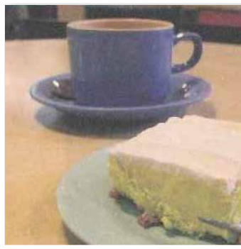
4:00 pm Afternoon tea- CUHK lemon pie and milk tea.