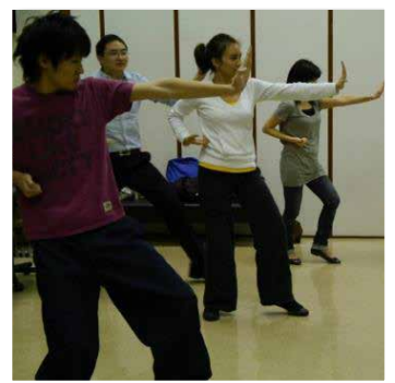
2:00 pm Shaolin Martial Art class