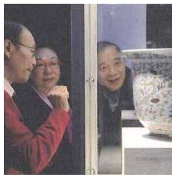
1:15 pm Exhibition in Art Museum