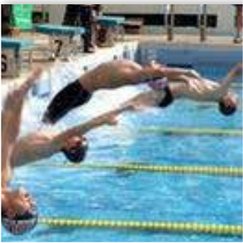
5:30 pm Swimming in campus pool