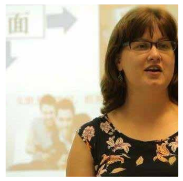
11:30 am Oral presentation in class