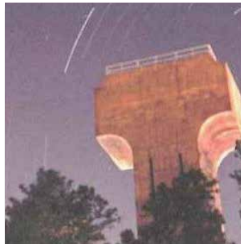
11:50 pm Star gazing on Main Campus