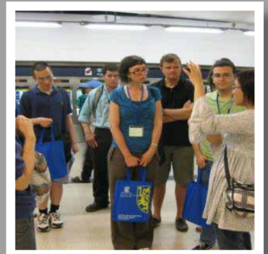
4:30 pm Down town Shatin orientation