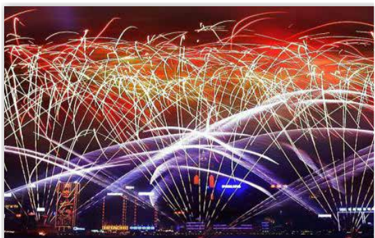
8:00 pm A Symphony of Lights at Victoria Harbour