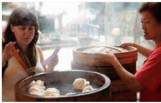
8:00 am Chinese Dim-sum breakfast

Beginning before sunrise and continuing long after sunset, life in CLC@CUHK bustles with activities. Different people come together at CUHK and come away with different things.