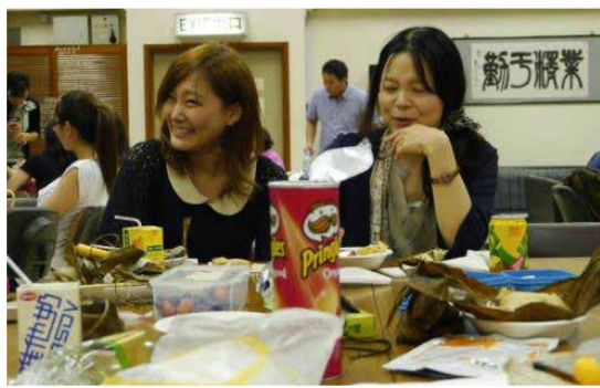
12:30 pm Language lunch table in Fong Yun Wah Hall