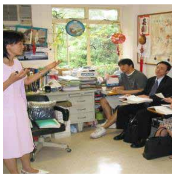
9:30 am Lecture and language activities