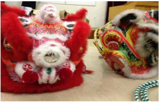
3:00 pm Lion Dance workshop