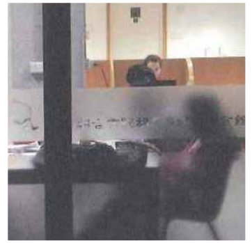
9:00 am Self-study in library