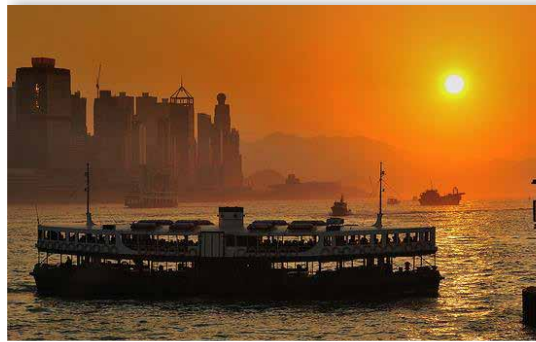
6:30 pm Watch sunset by Star Ferry steamboat