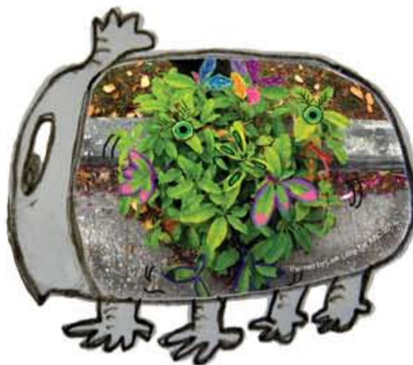
Tree Walks Field Trips and Country Park Visits

Hands-on approach learning by doing interacting with experts