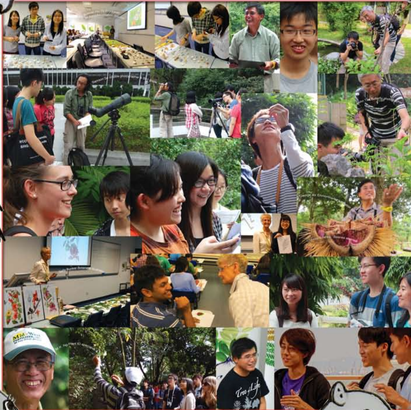
Plant ID and Interpretation Practice