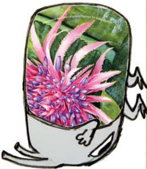
Botanical Illustration Workshop