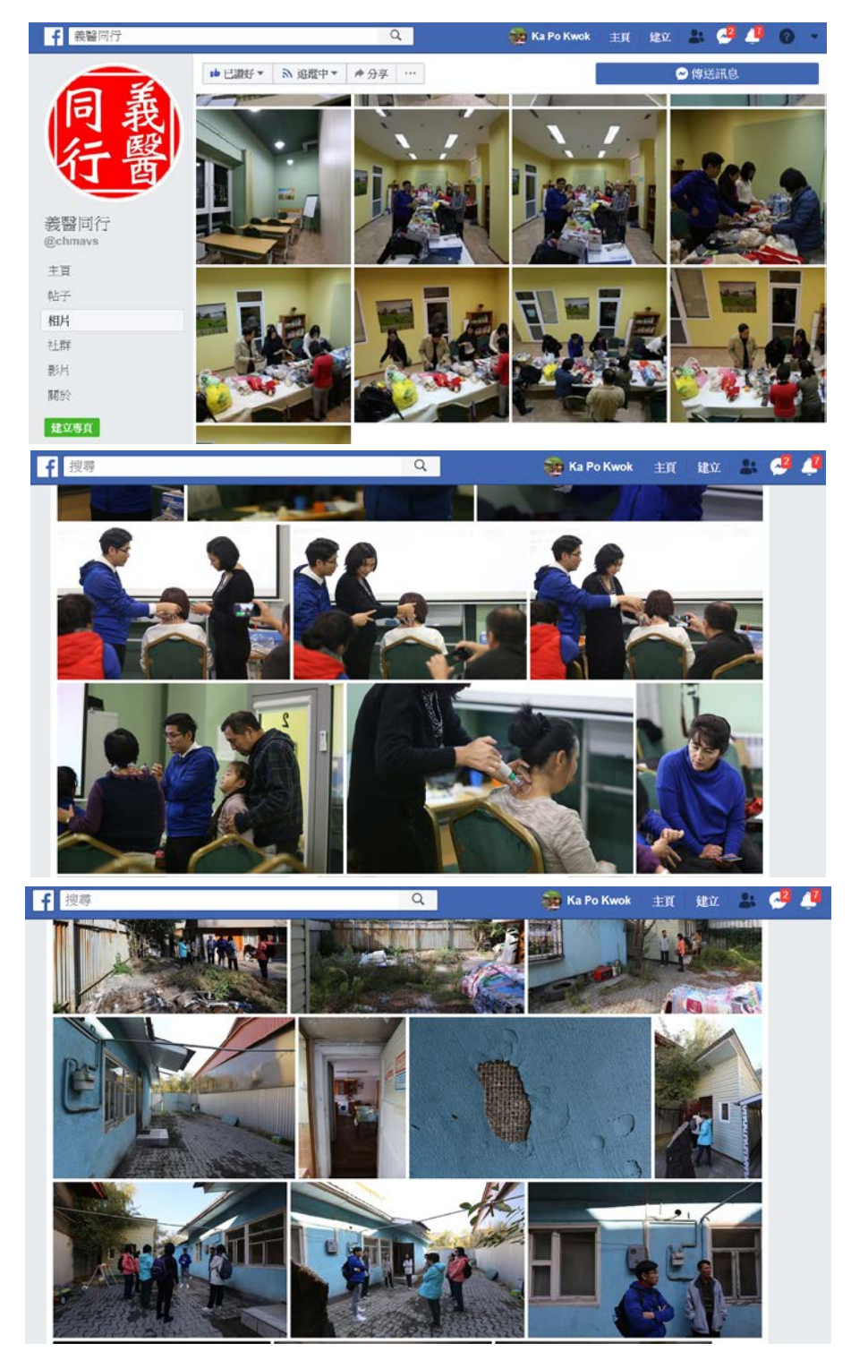
The updates of the team in Kazakhstan during the preparation process in Facebook Photos credit to: 'Capering Holistic Medical Alliance' (義醫同行)