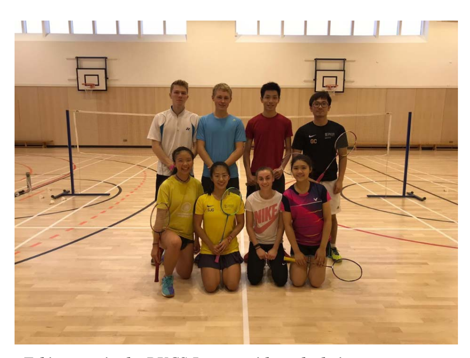
Taking part in the BUCS League with my badminton teammates.