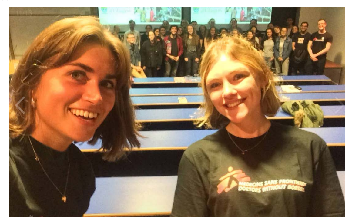
Taking a photo together with the staff and participants of the MSF Welcome night after the group sharing session.