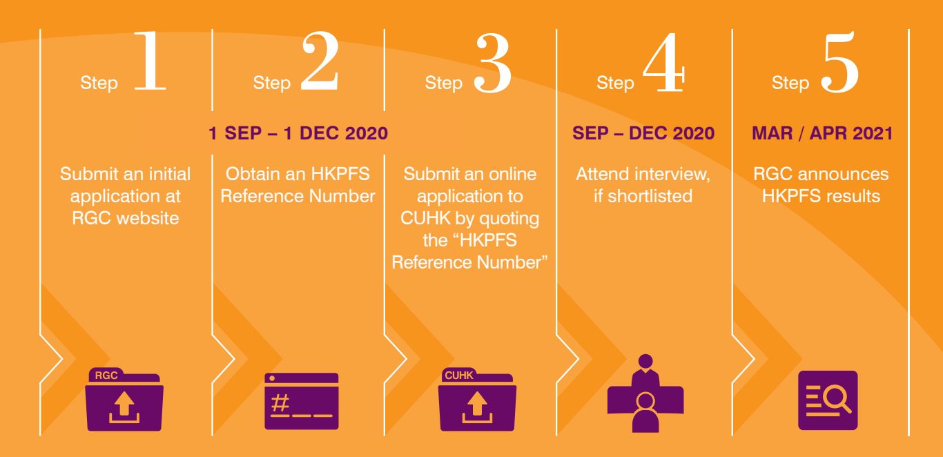
Find out more