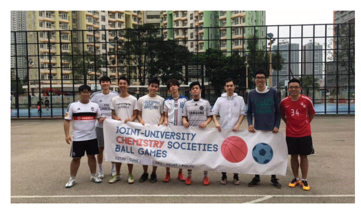
Joint University Soccer Match