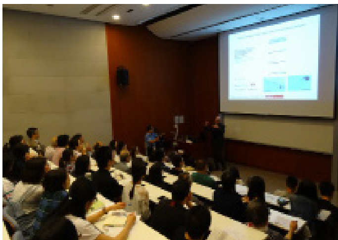
The audiences are captured by the series of the intriguing illustration of the animal Evolution.