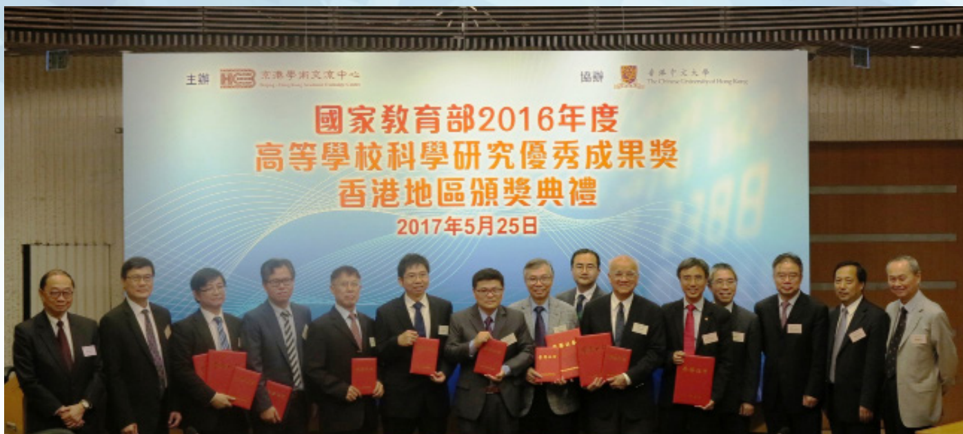
The award presentation ceremony is grandly held on 25 May, 2017 at Cho Yiu Hall, CUHK campus. Congratulations to all award recipients!