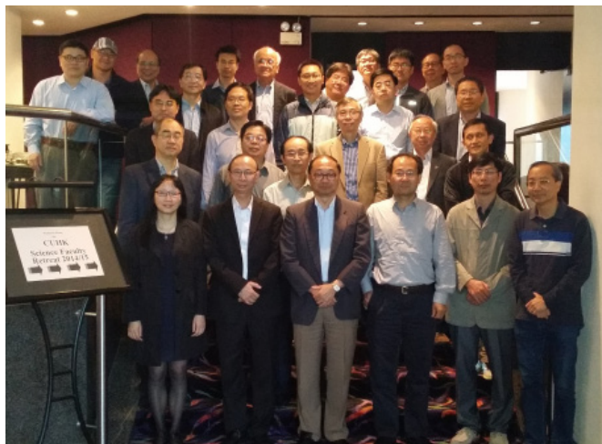
Dean of Science and faculty members at the Faculty Retreat 2014-15