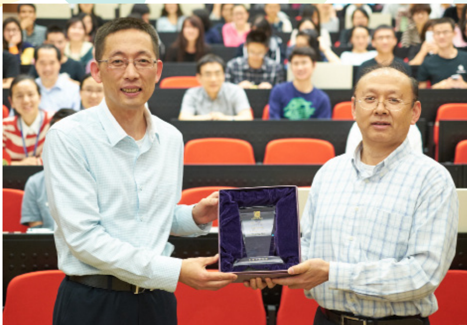
2015 C N Yang Lectureship in Physics - Professor SHI Yigong