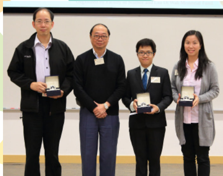
Dean of Science presents souvenirs to speakers.