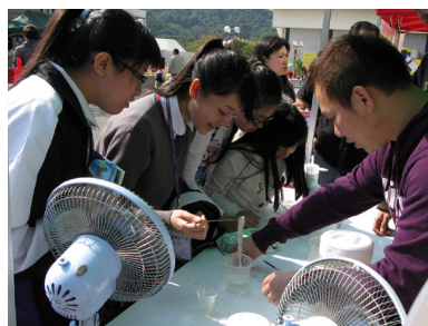
(LEFT) Visitors engaged in a fun hands-on experiment at the booth hosted by the Department of Chemistry.