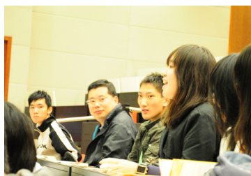
Students were enthused to hear such exciting lectures, and eagerly asked questions to further their understanding.

warmly welcomed the prospect of having such fun, informative science lectures continue in the future.