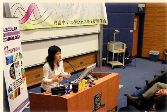
Highlights of MBT Alumni Association Inauguration Ceremony & Career Talk 2006