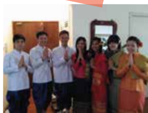
Activity of Thai Class