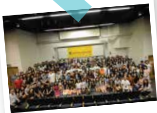
French Music Festival