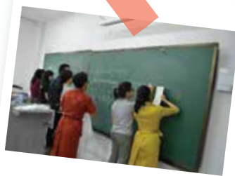
Field Trip on Tibetan Language