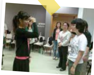
Hong Kong Sign Language Class