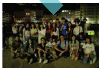
Summer Overseas Study