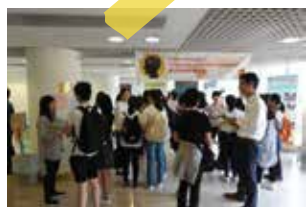
Orientation Day for Undergraduate Admissions