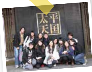
Field Trip to Shanghai