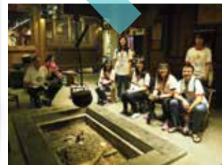
Cultural Trip to Chongqing