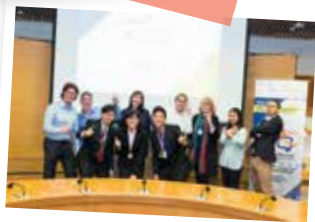
German Language Olympic