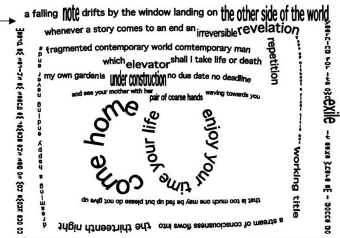
pinuagi ta sight died its mind and so be it let go whose life is it who can lead our way our destiny

"...Once you get ahold of CU Writing Vol. V, you are not going to let it go as you will be enchanted by all these intriguing stories... it's just like falling into a labyrinth and trying to seek your way out...readers...we won't let you go..."