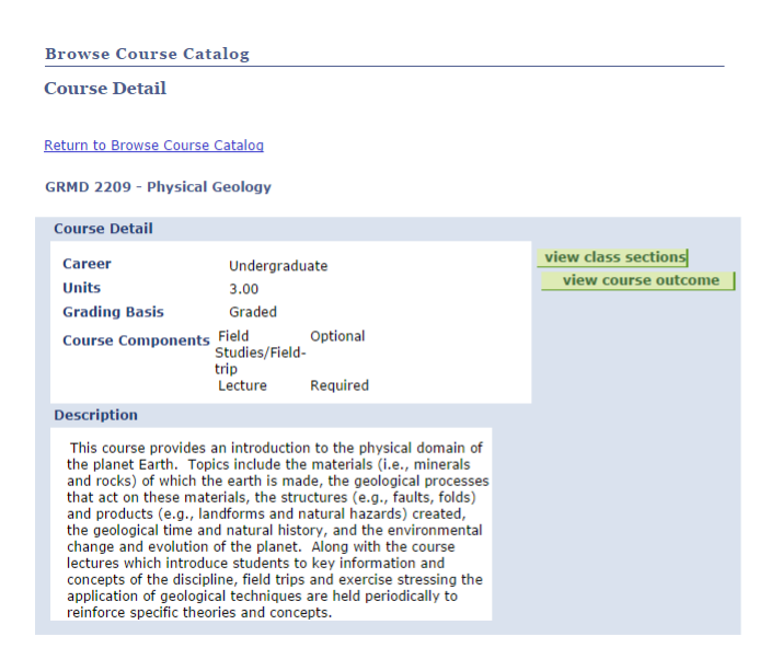
Figure 8: Browse Course Catalog - Course Information