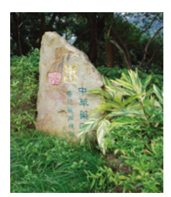
The 800 m² HERBSNSENSES Chinese Medicinal Garden is the home for over 20 flowering and fragrant herbs planted for teaching and research purposes.