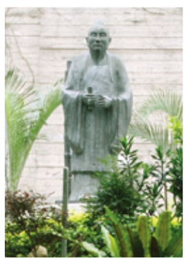
The bronze Statue of Confucius faces north towards the hometown of Confucius in Shandong province. At the back of the statue is a bamboo stick engraved with Confucius' teaching ideal, 'ever learning, and never tired of teaching'.