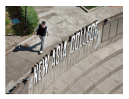
The New Asia Amphitheatre is a popular venue for student activities. Names of the College graduates are engraved on its two curved walls.