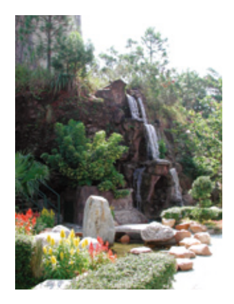
Built in 1996, the Cascade is a popular venue among students for graduation photographs.