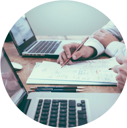
P3 - Instructional design support