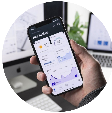
P6 - Personalized profile & learning paths