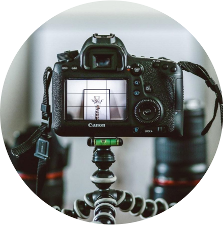
P1 - Multimedia content co-creation