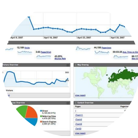
P5 - Advanced eLearning analytics