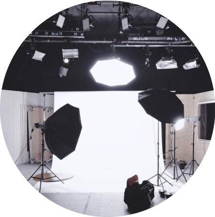
P2 - MOOC development