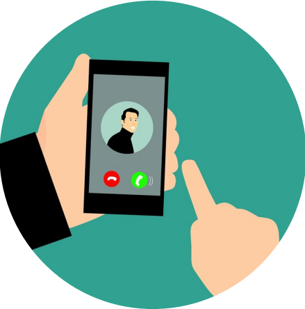
P4 - Online learning