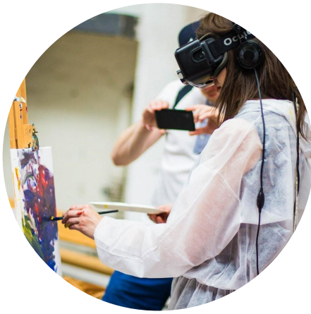
P7 - Innovative tech like VR/AR/MR, gamification, geolocation